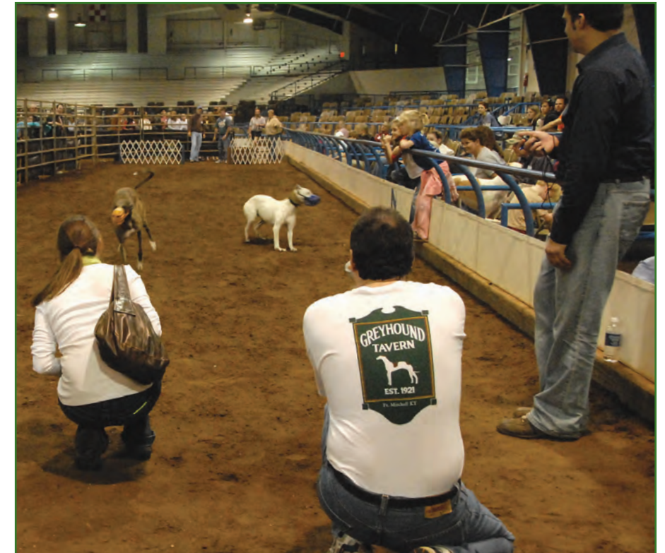
Competitive mini-races are just one of the fun activities at GPA/N's Feb. 22 Winter Gathering at the Tennessee Livestock Center in Murfreesboro.

GPA/N will be selling Silk Road martingale-style collars and a variety of fleece greyhound jackets. Other vendors include GreytArt, See Spot Eat, Run with It Embroidery and Pets Rule, so be sure to bring your checkbook.